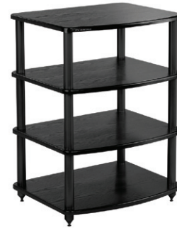
SE-A4 (Black Oak)-B