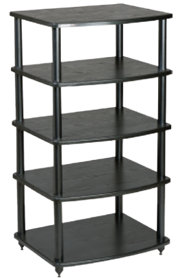
SE-A4 (Black Oak)-B + AA1

NOTE: All SE-V3 42 video units include the necessary hardware to allow you to assemble the unit with or without the mid-shelf center tube (for center-channel considerations).