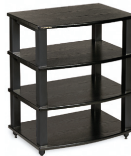
XT-A4 (Black Oak)-B