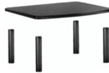
SE-AA1 (Black Oak)-B