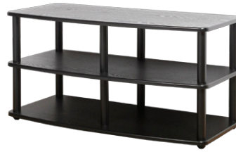
SE-V3 42 (Black Oak)-B (with center tube installed)