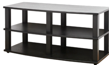
XT-V3 44 (Black Oak)-B (with center tube installed)