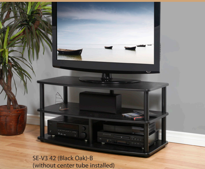
SE-V3 42 (Black Oak)-B (without center tube installed)