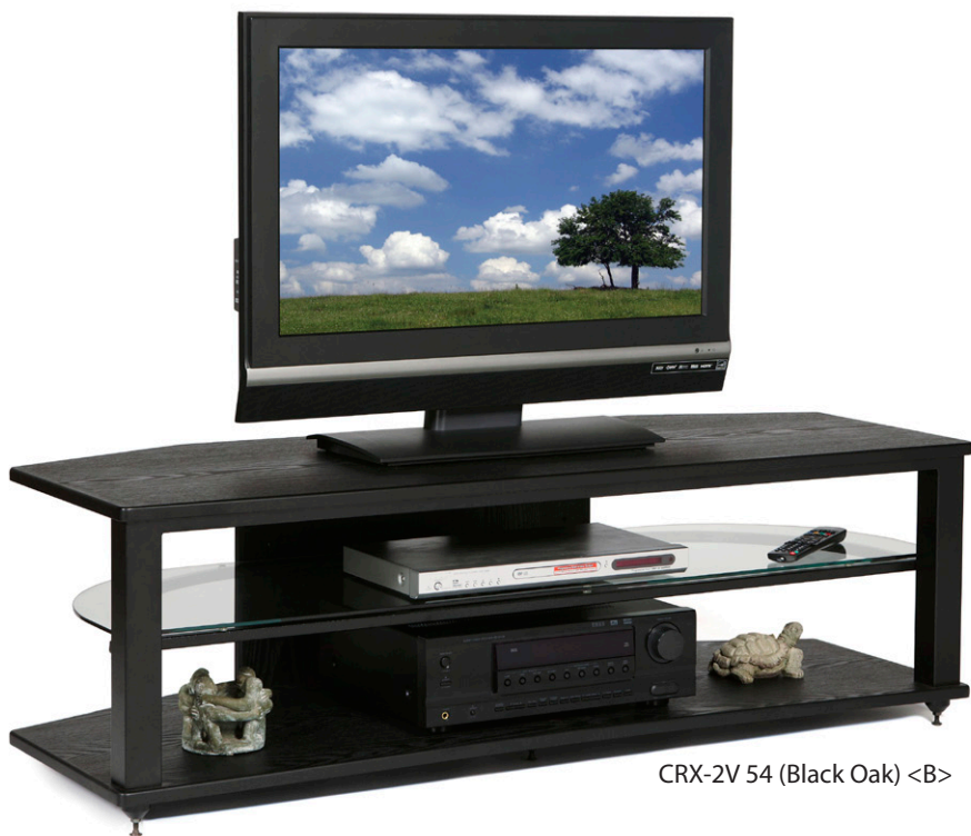
CRX-2V 54 (Black Oak) <B>