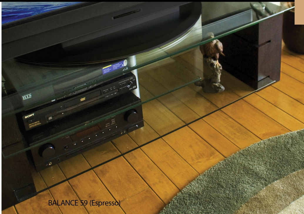
BALANCE 59 (Espresso)

Available in a choice of luxurious natural wood veneers - Black Oak (B), Espresso (E), and Walnut (W). The Black Oak model is offered in Black Glass. The beauty and genius of the design allows for easy assembly ( approximately 5 minutes ).