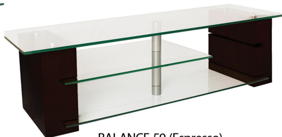
BALANCE 59 (Espresso)