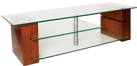
BALANCE 59 (Walnut)