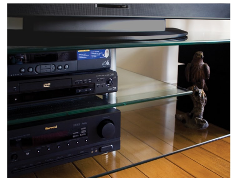
BALANCE 59 (Black Oak)