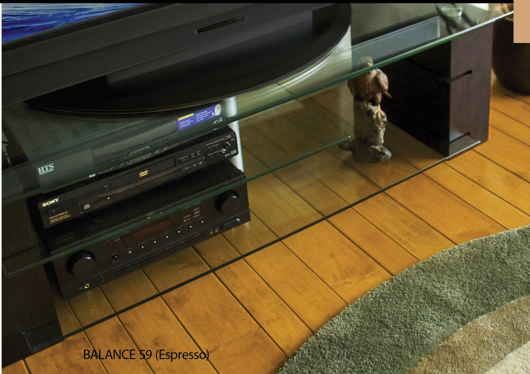
BALANCE 59 (Espresso)

Available in a choice of luxurious natural wood veneers - Black Oak (B), Espresso (E), and Walnut (W). The Black Oak model is offered in Black Glass. The beauty and genius of the design allows for easy assembly ( approximately 5 minutes ).