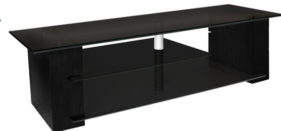
BALANCE 59 (Black Oak) (Black Glass)