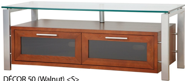
DÉCOR 50 (Walnut) <S>